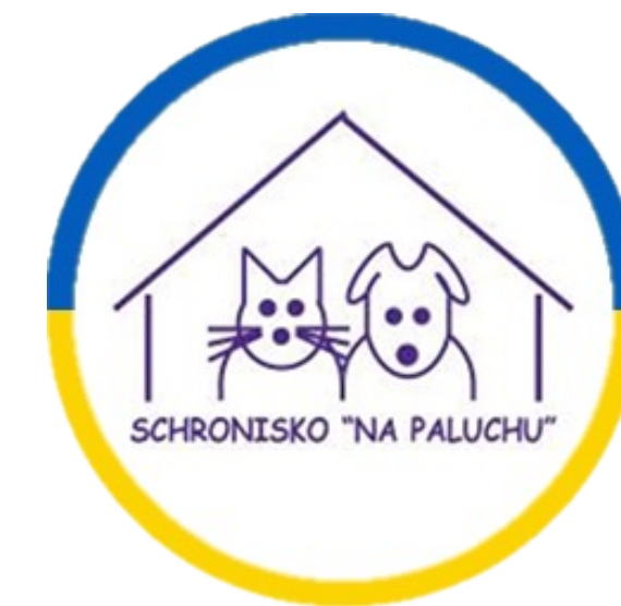
Schronisko "Na Paluchu"