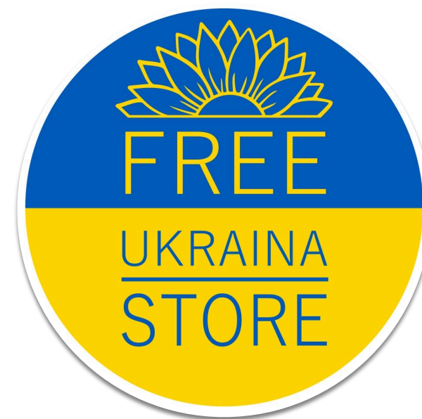
Free Ukraina Store